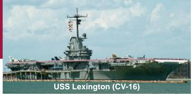
USS Lexington (CV-16)